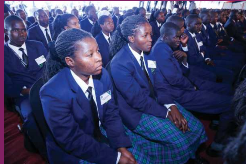
Mpesa Foundation Academy, Students at the event.