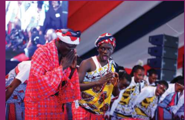
Captivating Traditional Dance by the Mpesa Foundation Academy Students.