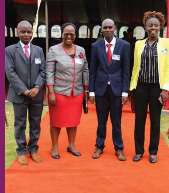
Mpesa Foundation Academy, Resource Centre Staff at the event.