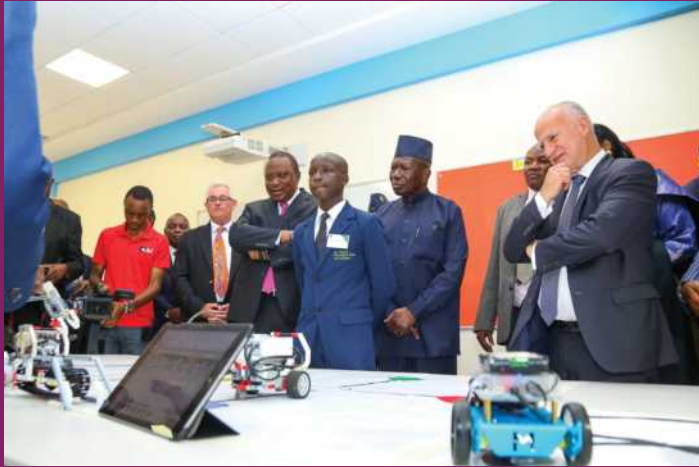
A captivating demo of STEAM robotics.