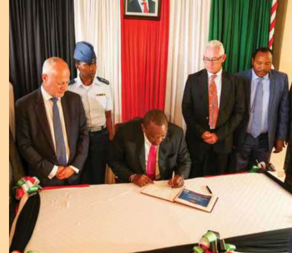
His Excellency Hon. President Uhuru Kenyatta signs the MPESA Foundation Academy Esteemed Visitors Book.