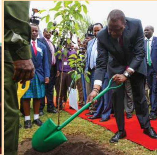
His Excellency Hon. President Uhuru Kenyatta plants a Tree at the Academy for posterity.