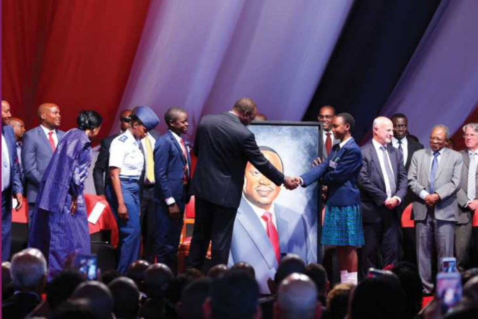
His Excellency Hon. President Uhuru Kenyatta receives a portrait from an art student.