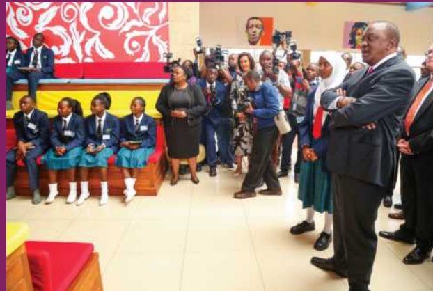
His Excellency Hon. President Uhuru Kenyatta visits the Academy resource centre.