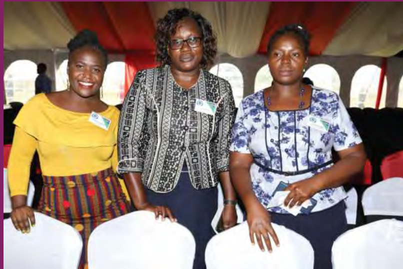
Mpesa Foundation Academy, Staff at the event.